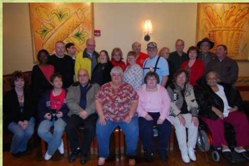
Great turnout at the February Wilkins meeting!